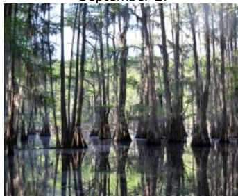
16 x 20 mounted frameless print "Clear Lake Morning"