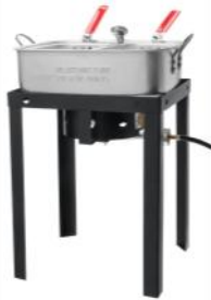
Dual basket propane fish fryer