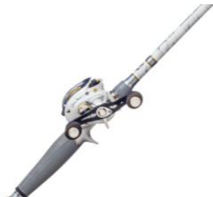
Carbonlite II Baitcast rod and reel