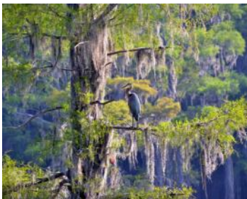
16 x 20 mounted frameless print "Blue Heron"