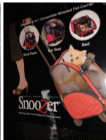
Rolling pet carrier