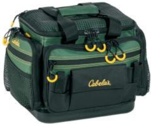
Soft side tackle box