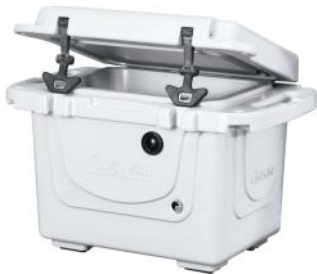
25 qt polar cap equalizer cooler