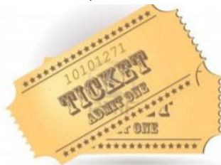
4 tickets + swag Texas Rangers vs. NY Yankees September 27